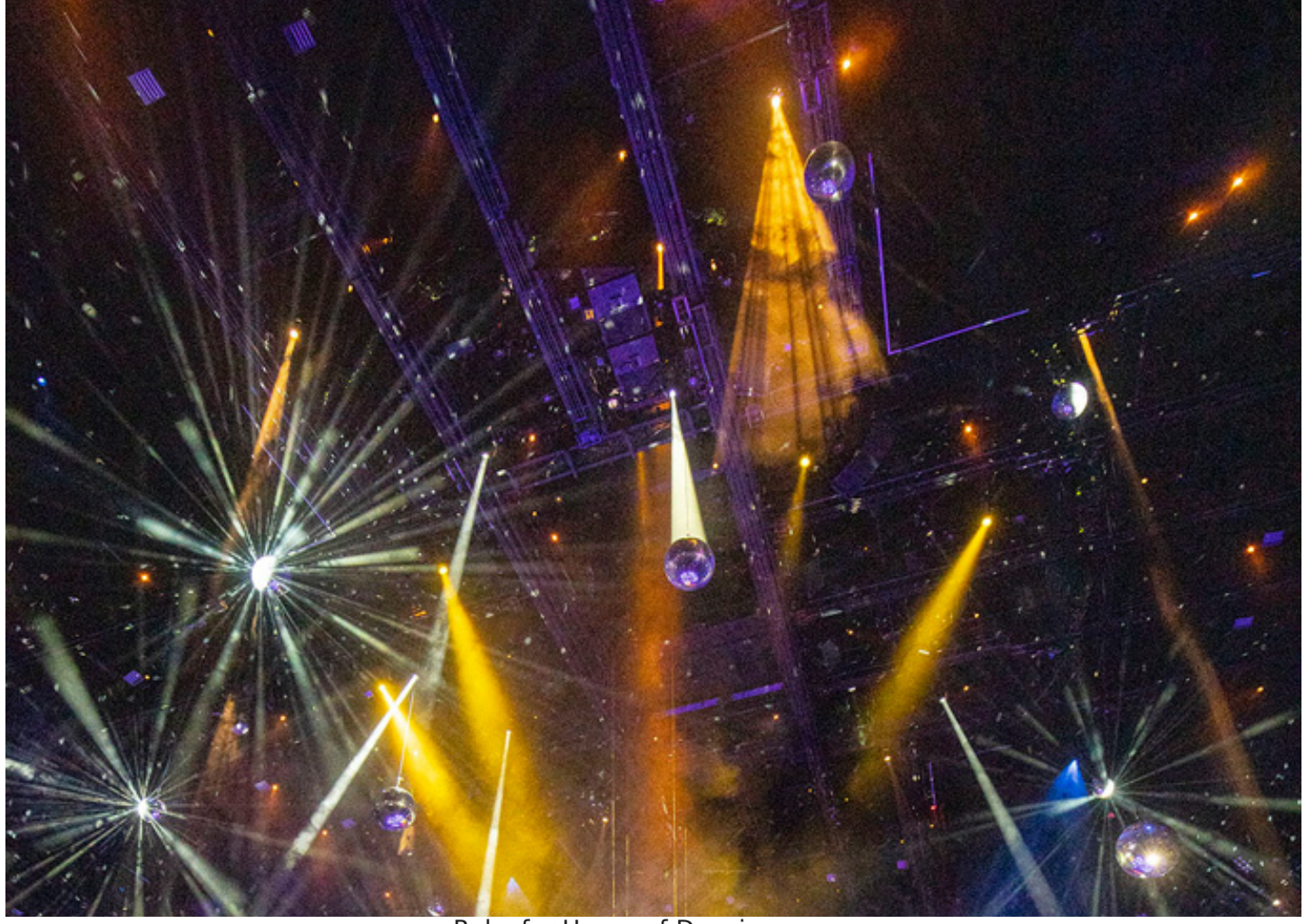
Robe for House of Dancing Water Show Spectacular