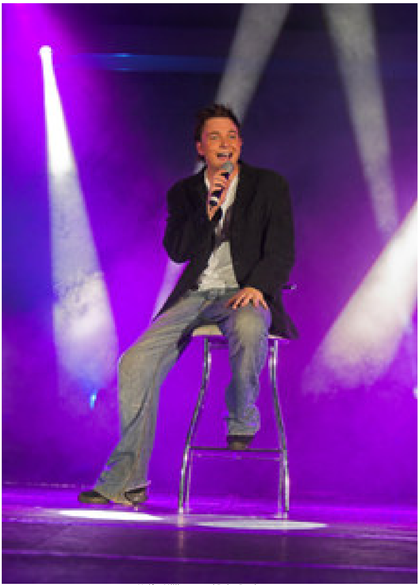
Half a Million pound Robe Deal for Butlins