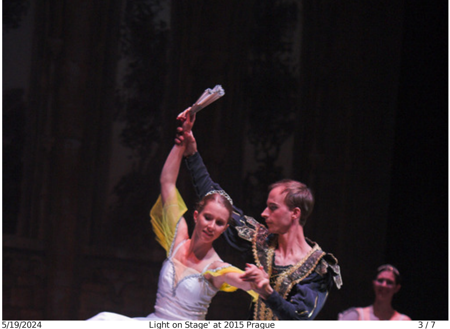
Light on Stage' at 2015 Prague Quadrennial