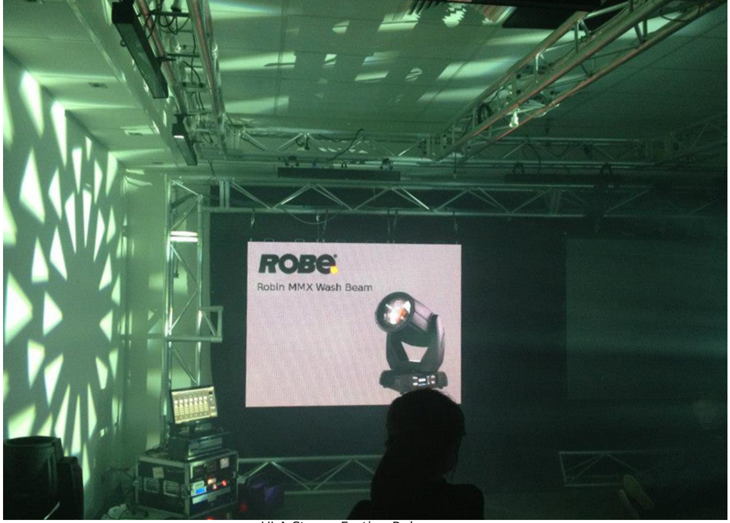
ULA Stages Festive Robe Roadshow